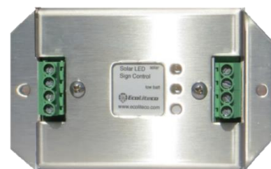
12-Volt Stainless-Steel Solar Charge Controller

Effortlessly create an independent solar-power source for any sized 12-volt DC LED lighting solution with an EcoLiteco 12-volt Stainless-Steel Solar Charge Controller . Built in North America, each controller is completely sealed in epoxy potting to prevent electronic component failure. Our rugged 12-volt Stainless-steel Solar Charge Controller is micro-processor controlled which allows us to maximize battery-life expectancy by programming the exact charging voltage and the amount of discharge specific to each battery type. EcoLiteco's charge controller's component and battery safeguard features protect our customer's solar lighting investment well into the future.